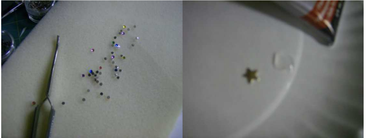
To keep your crystals from moving, place them on a piece of fleece fabric

Another good choice is this hypo-cement used for jewelry making. I love the fine tip