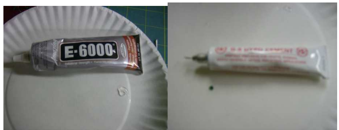
E6000 is a very strong glue – you can dip your crystals in and then drop onto your card and push down to secure

Another good choice is this hypo-cement used for jewelry making. I love the fine tip